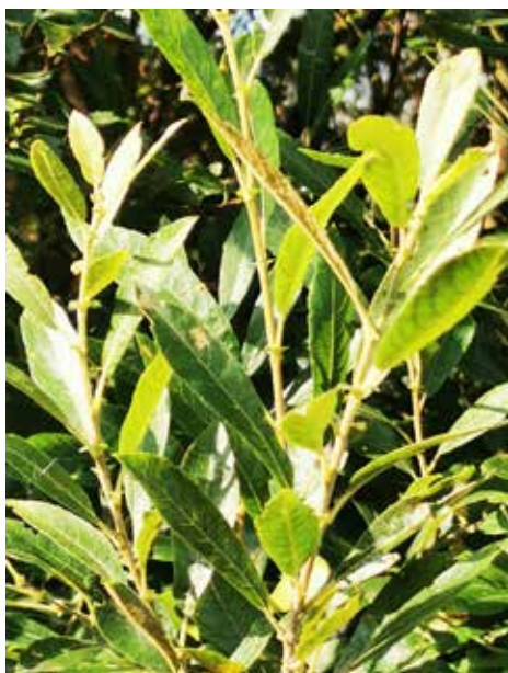
Sally Saileach liath Salix cinerea