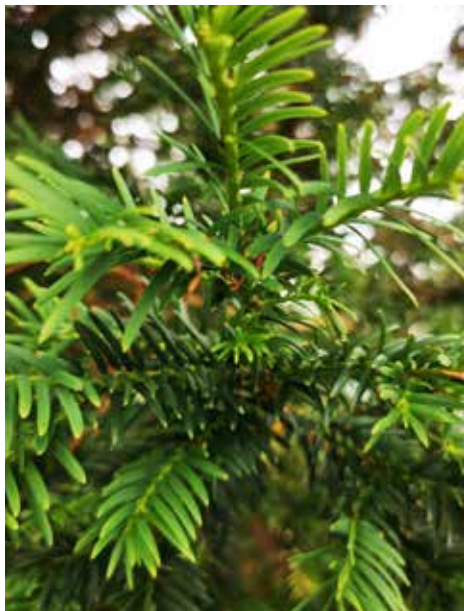
Yew Iúr Taxus baccata