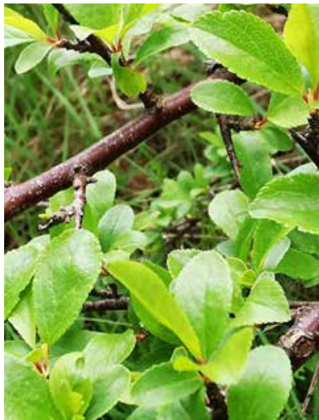
Blackthorn Draighean Prunus spinosa