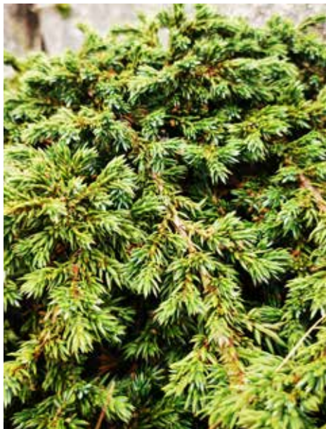
Prostrate Juniper Aiteal Juniperus communis subsp. nana