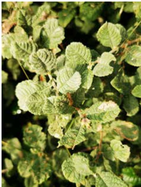
Eared Willow Crann sníofa Salix aurita