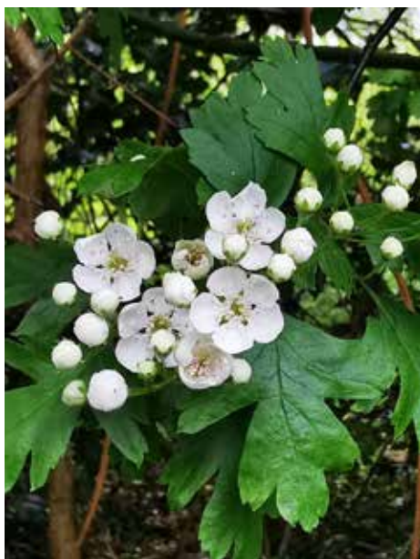
Hawthorn Sceach geal Crataegus monogyna