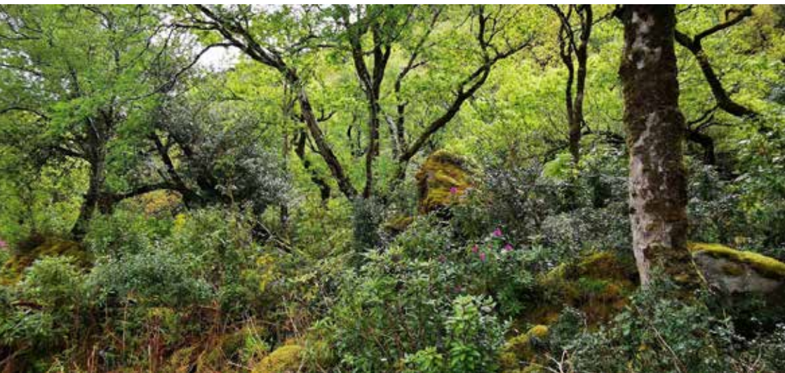
The rocky terrain of Mullangore

As a woodland tree, Oak supports a multitude of other species. A great diversity of flora and fauna finds a habitat and food supply in the shelter of oak. Natural woodlands are important refuges for the indigenous plant and animal species. Because of the pressure of the human population and forest clearance for agriculture, native oak woodlands are one of the rarest and most endangered of vegetation types in the Irish landscape.