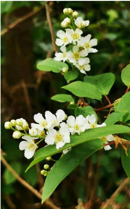
Prunus padus at Glenveagh

On the upper reaches of the Glenlack stream is where the Bird cherry - Prunus padus is found, a beautiful flowering tree with white blossoms in April and laden with small black cherries in August. By October its leaves turn bright red before being shed. Its presence in the woodland mix is another indication that these are old woodlands in the Donegal landscape. The same species occurs in neighbouring Gartan in old woodland on the approach to Glendowan Chapel.