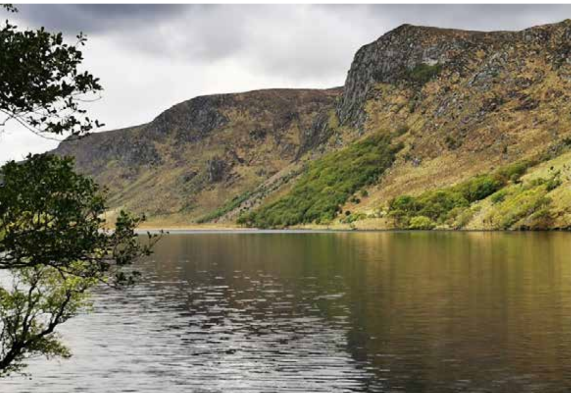
Derrybeg Wood and Binnakilty Wood viewed from across the lake