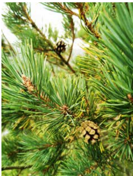
Scots Pine Gíuis Pinus sylvestris