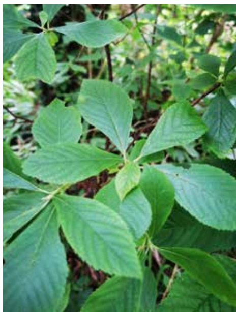
Wild Cherry Crann Sílin Prunus avium