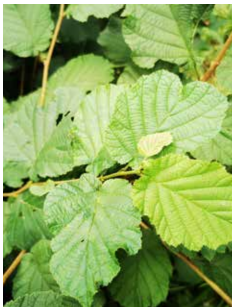
Hazel Coll Corylus avellana