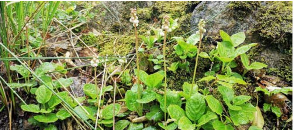
Wintergreen, Pyrola media at Glenveagh

The discovery of Wintergreen Pyrola media , a rare and beautiful woodland flower in Mullangore wood within the last 10 years is yet another indicator of the remarkable botanical diversity of this ancient woodland.