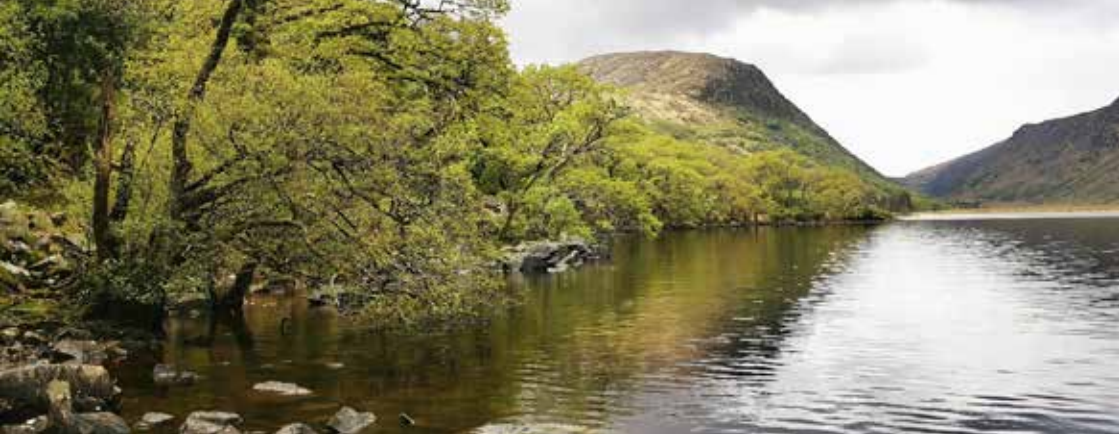
Lakeside setting of Mullangore Forest

In the lower parts of the woods, the trees gain in height due to the greater shelter provided and the better soils. Their straight stems rise to 15m on average.