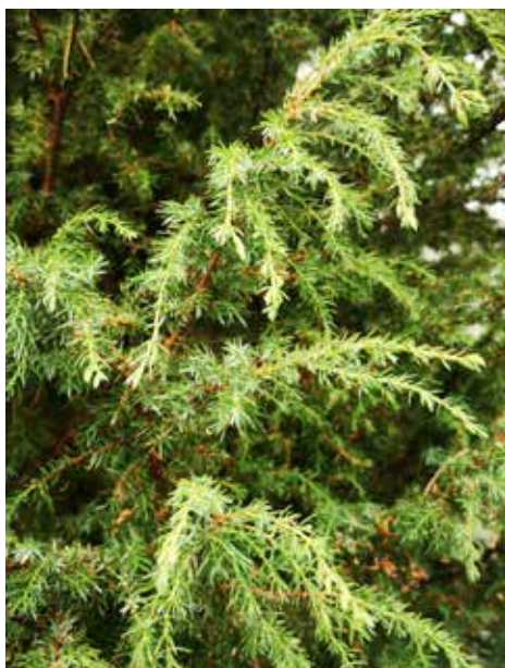
Upright Juniper Aiteal Juniperus communis subsp. communis