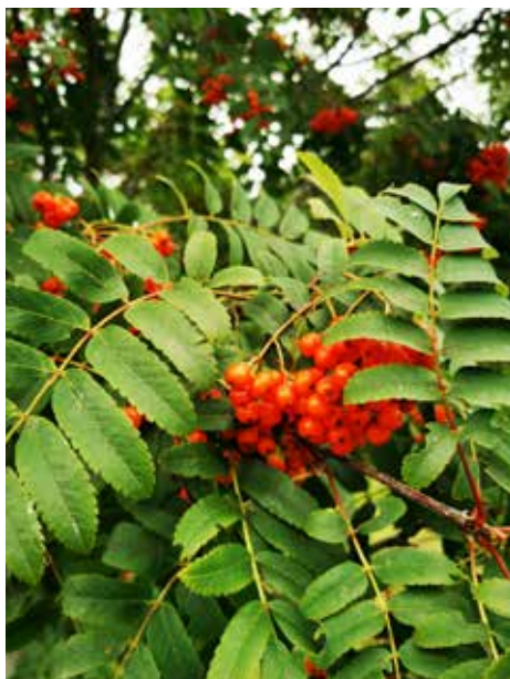
Rowan Caorthann Sorbus aucuparia