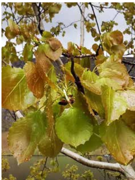
Aspen Crann Creathach Populus tremula