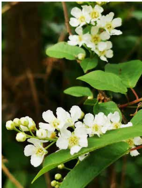
Bird Cherry Donnroise Prunus padus