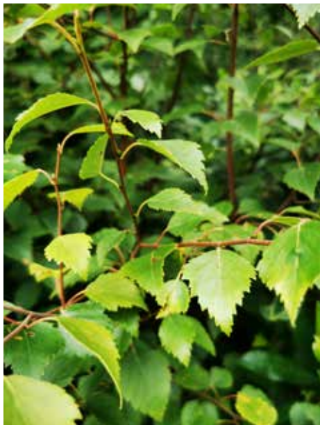
Downy Birch Beith chlúmhadh Betula pubescens