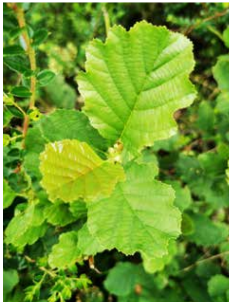
Alder Fearnóg Alnus glutinosa