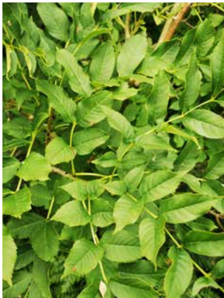
Ash Fuinseog Fraxinus excelsior