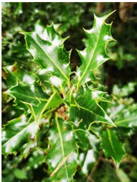
Holly Cuilleann Ilex aquifolium