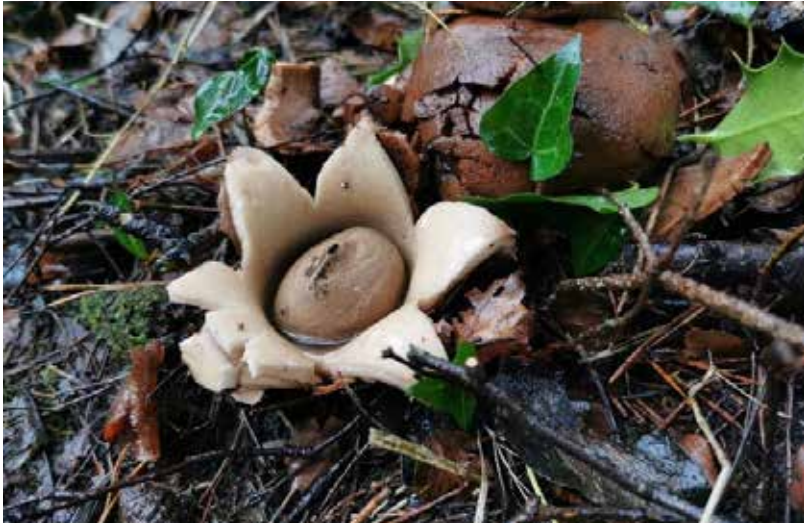
Earthstar – Gaestrum triplex