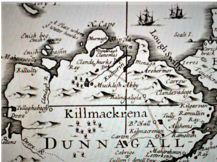
Down Survey General Map showing lake and woodland (under Ray) at head of river flowing to Doe Castle

The general map (Down Survey) of the northern half of Ireland gives the first reasonably accurate indication of the lake at Glenveagh bordered by woodlands in the upper reaches of the Owencarrow river system. The surviving ancient woodlands of Glenveagh are remnants of once extensive forests that existed in Ulster.