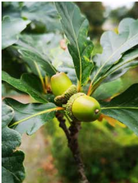
Sessile Oak Dair Ghaelach Quercus petraea