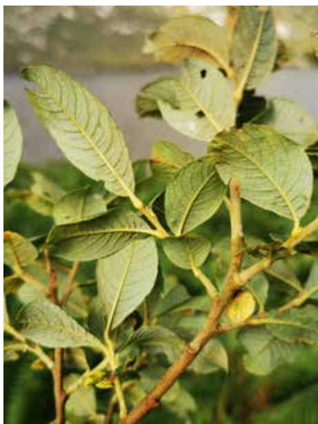
Goat willow Sailchearnach Salix caprea