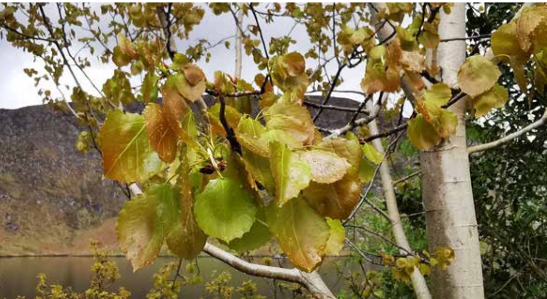
New leaves on Aspen in May