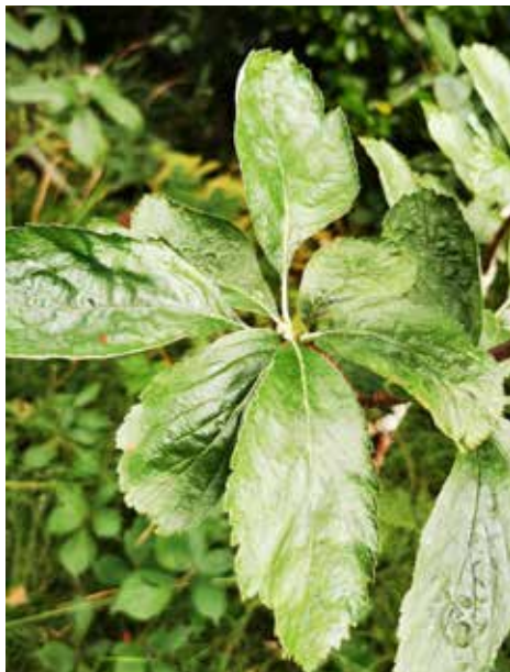
Rock Whitebeam Fionncholl creige Sorbus rupicola