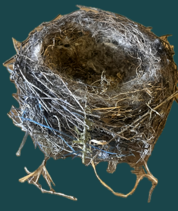
Birds build their nests from all sorts of available material often using animal hair or wool. This bird has incorporated some strands of bailing twine into its nest.

If you find a chick out of the nest Birdwatch Ireland recommend that if it is fully feathered and appears alert and healthy simply leave it alone and its parents will continue to tend to it. If the chick is blind and helpless it is best to return it to its nest if it is safe to do so. A sick or dead bird should not be handled as avian flu is still circulating in the wild bird population in Ireland, for more advice and information on this see: <u>www.gov.ie/birdflu</u>