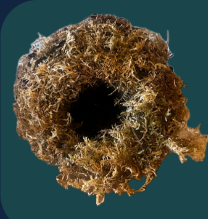
This Wren's nest is made from moss and leaves and lined with feathers. The wren's scientific name Troglodytes troglodytes means 'cave dweller'

The Burren National Park is host to around ninety five species of bird, fifty species of which have used the park for breeding. From Peregrine Falcons Falco peregrinus to Golden Plover Pluvialis apricaria to Yellow Hammers Emberiza citrinella and Wheaters Oenanthe oenanthe , the park and its surrondings offer an ideal habitat for resident and migratory birds.